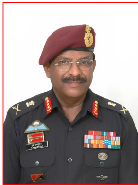
LT GEN N THAMBURAJ, SM GOC-IN-C, SOUTHERN COMMAND

It is a matter of great honour for all Bombay Sappers that Lt Gen N Thamburaj, SM assumed the prestigious appointment of GOC-in-C, Southern Command on 01 Oct 2007.